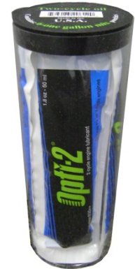
Pro-Tube protective 6-pack 20612